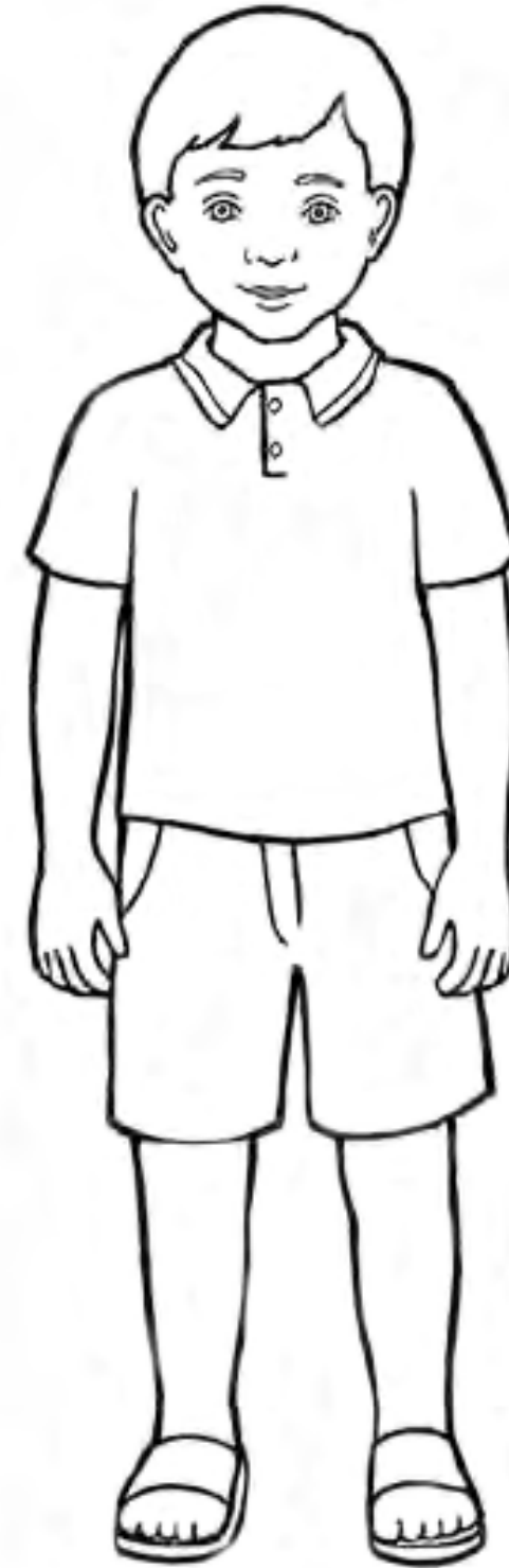
Color the way you would like God to see you.

I can use all parts of my body to please God and to help my Soul shine so I can be in Heaven one day.